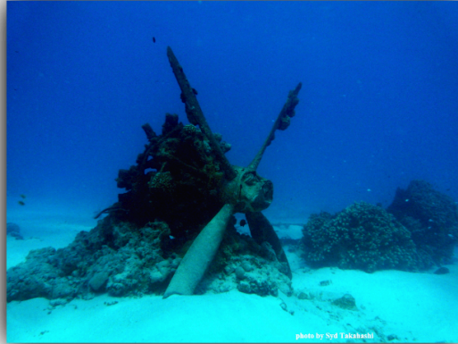
Wreck site, Saipan Lagoon

Minimax is a locally owned and operated small business, with tours and instruction available in English & Japanese.